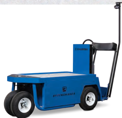
Stockchaser with Strobe Light

A tool-carrying workhorse. Rugged storage for industrial and event use.