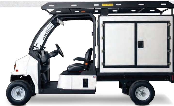
Utilitruck Van Box & Ladder Rack

Tailored for ground crews. Secure, weather-ready space for tools, trimmers and debris across sprawling properties.