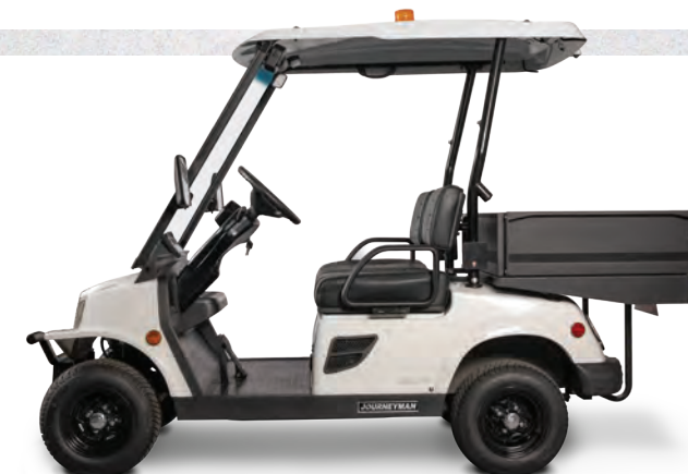
Journeyman 2X Drop Sides Worksite

Four-passenger capability with room to spare. Ideal for task-focused teams.