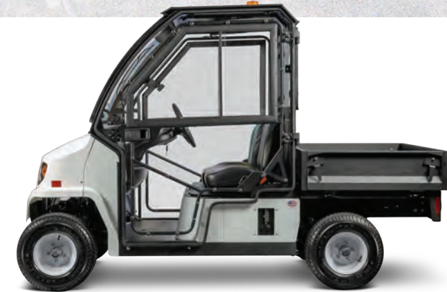
Utilitruck 2X Landscape with Cab

Columbia offers the broadest range of electric utility vehicles in the industry — from people movers to industrial-grade workhorses. Each platform is available with a variety of upfits, battery systems, seating configurations and custom options.