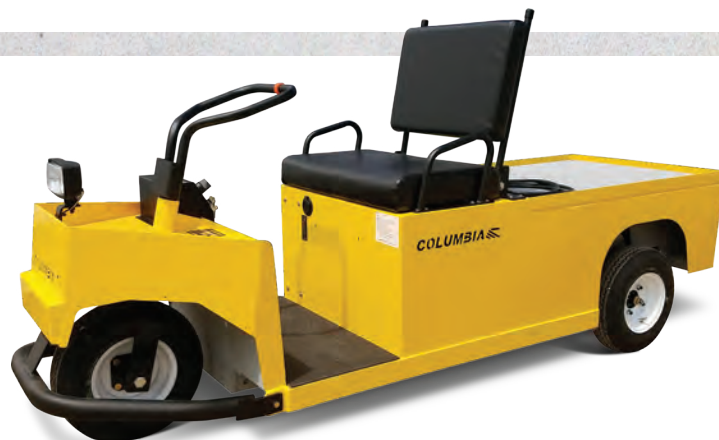
Expediter 24- or 48-volt

A nimble hauler for tools and light cargo. Fast, efficient and all business.