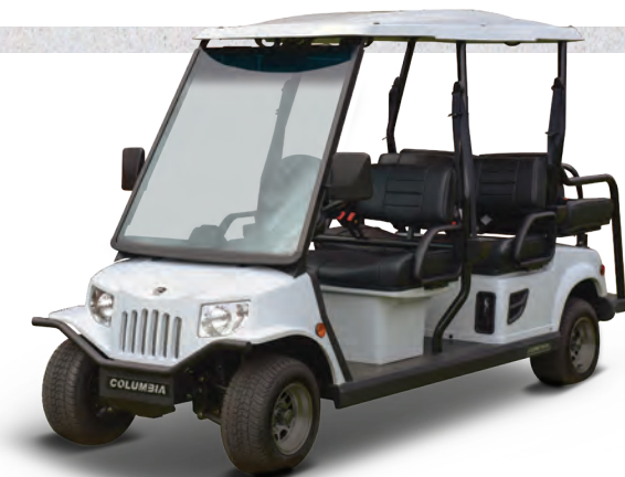
Journeyman 4X Transportation

Built for worksites. Drop-side versatility with rugged durability.