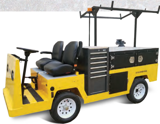
Payloader Tool Express

A tool-carrying workhorse. Rugged storage for industrial and event use.