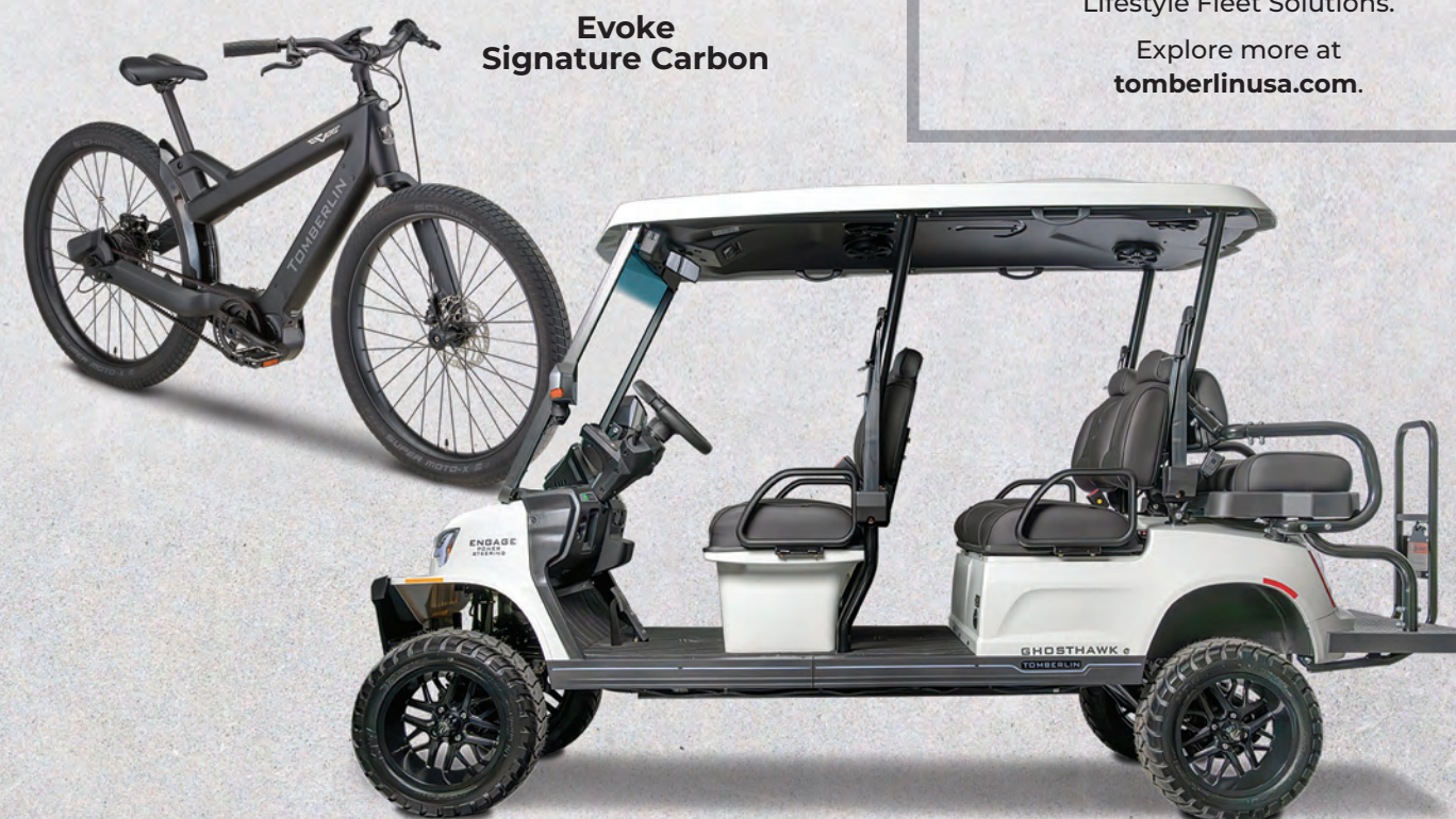
Evoke Signature Carbon