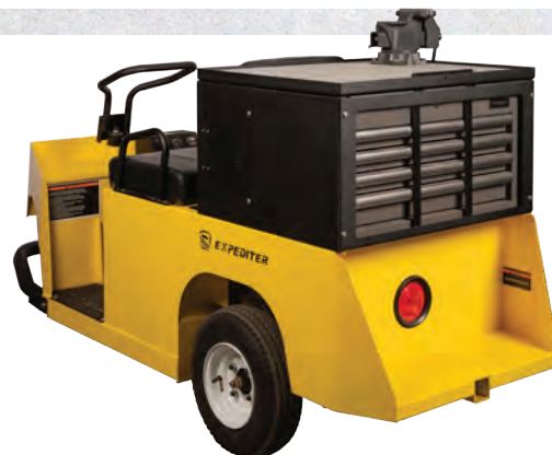
Expediter Tool Express

Single-person power for fast facility navigation. Nimble, quick and always ready.